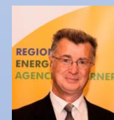
Director Institution Regional Energy Agency Kvarner Croatian national coordinator for EU Smart Islands Initiative