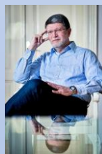
Tonino Picula Croatian Member of the European Parliament